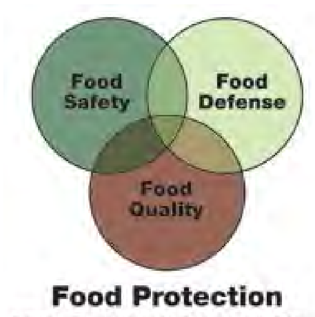
Figure 1. The interconnection of food safety, defense and quality result in comprehensive food protection.